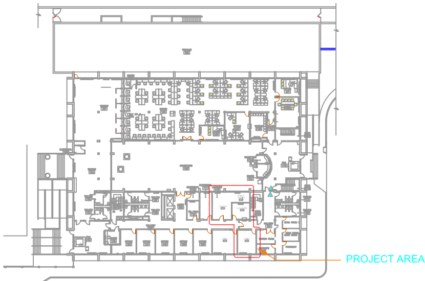
1ST FLOOR PLAN (showing project area)